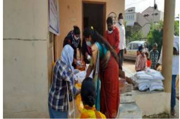
Nagar Leprosy Colony at Telangana.

APAL and all beneficiaries are conveying thanks to SILF for their great humanity in this crisis even.