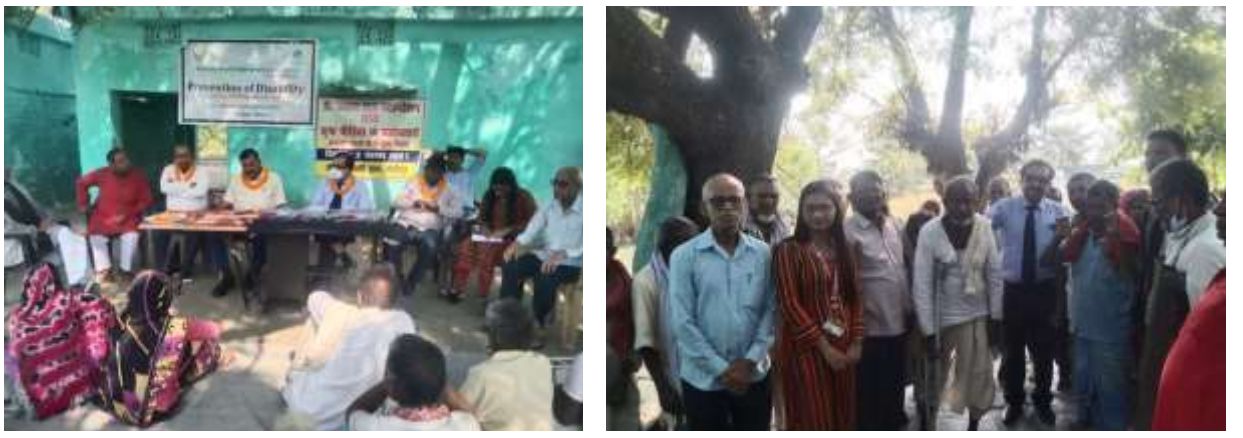
The request of the APAL's state committee Bihar(SAMUTHAN), the health department of Bihar conducted the COVID-19 vaccination campaign

Supported by 笹川保健財団 Sasakawa Health Foundation